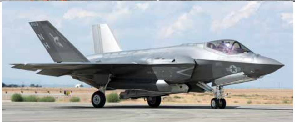
Above left: F/A-18E 166443/'NH-206' recovers to Lemoore to complete one of VFA-147's final Super Hornet missions. The 'Argonauts' technically began transition to the F-35C in December 2017 after returning to Lemoore following a six-month deployment aboard the USS 'Nimitz' as part of CVW-11. Above: Looking pristine under the California sun, serial 169161/'NH-403' is one of the first F-35Cs assigned to VFA-147. Known to the Lockheed Martin factory as CF-25, this aircraft served with VFA-101 'Grim Reapers' at Eglin AFB – the initial F-35C FRS – before being transferred to the 'Argonauts'. Left: A member of the deck crew directs an F-35C on the flight deck of the Nimitz-class carrier USS 'Abraham Lincoln' during air wing integration exercises in the Atlantic last August. The jet already wears partial VFA-147 markings. Below: F-35Cs from VFA-147 over Lemoore – home of the US Navy's Joint Strike Fighter Wing. The wing was formally established on October 1 and is charged with overseeing training, manning and readiness of all the service's F-35C squadrons.