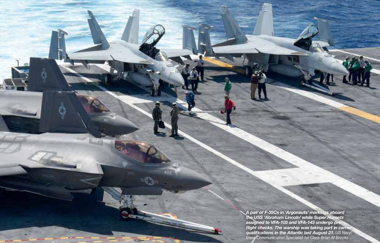
A pair of F-35Cs in 'Argonauts' markings aboard the USS 'Abraham Lincoln' while Super Hornets assigned to VFA-103 and VFA-143 undergo pre-flight checks. The warship was taking part in carrier qualifications in the Atlantic last August 21.