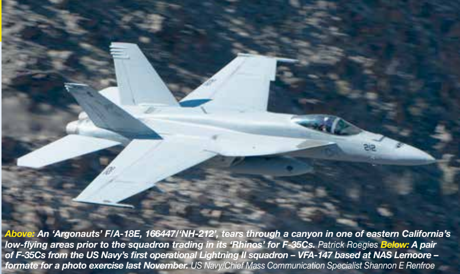
Above: An 'Argonauts' F/A-18E, 166447/NH-212, tears through a canyon in one of eastern California's low-flying areas prior to the squadron trading in its 'Rhinos' for F-35Cs. Below: A pair of F-35Cs from the US Navy's first operational Lightning II squadron – VFA-147 based at NAS Lemoore – formate for a photo exercise last November.

During Operation Iraqi Freedom, the 'Argonauts' and Carrier Air Wing (CVW) 9 operated from the USS Carl Vinson (CVN 70) for an eight-month deployment beginning in January 2003. ▢